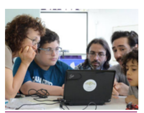
Creative technologies workshop