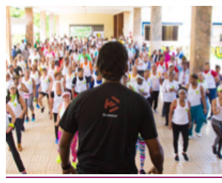
Zumbacoop for Health

Along with the Social Management and the Education Com-