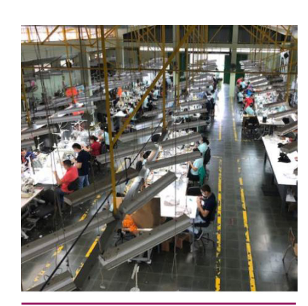
Interior of the Salónica headquartes