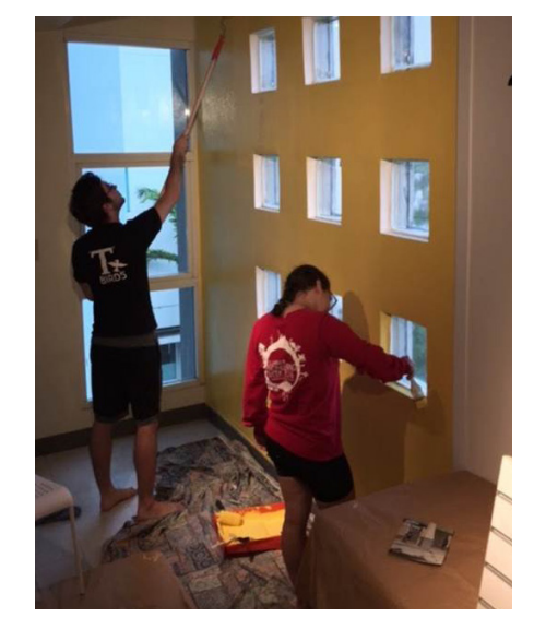
Adaptation of a new work space (after the Hurricane

Chart on research methodologies for case studies