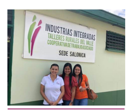
Industrias Integradas, Salónica headquarters